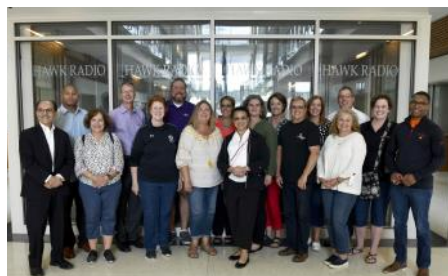
(Left) Members of Leadership Maryland pose in front of Hawk Radio, the student radio station supervised by the English department's digital media staff, during their recent tour of the university's Engineering and Aviation Sciences Complex.