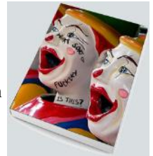
Cover art courtesy of Devil's Party Press

DPP is headquartered in Milton, Delaware. The contributors to the anthology are from all over the world.