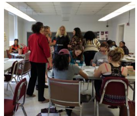
English faculty and students take time out for a little socializing.

The department will host similar "socials" at 3 p.m. on the first Wednesday of each month during the school year. Come hungry to 2111 Wilson Hall on October 4.