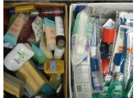
Travel-size toiletries donated by Department of English and Modern Languages faculty

When Hawk Radio , the student-managed online radio station supervised by the English department, asked department faculty to assist in a campus effort to provide small toiletry items to the homeless, they responded. At final count, the English faculty donated two boxes full of 147 different items including shampoo, tooth paste, soap, body lotion and deodorant.