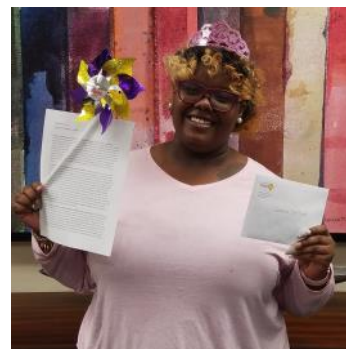
First place celebration

The company offers support services in, among other things, marketing and publishing. Each year it challenges its staff to create a unique story using the company’s “Weekly Words.” The submissions are judged on the quality of their narrative, syntax structure, spelling, grammar, punctuation and correct usage of the required words.