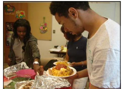
Spanish language students celebrate the end of the spring semester with a Cinco de Mayo fiesta.