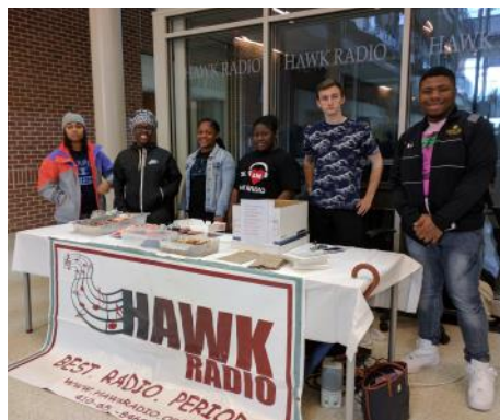
Hawk Radio bakers and sales staff

If you missed it, don't worry; there's another planned for Friday, Dec. 7.