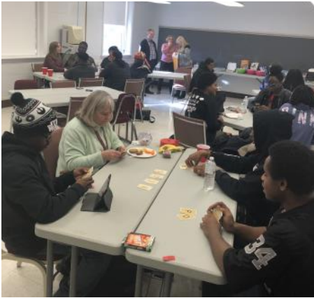
Scrabble Slam players at the March Social

The Department of English and Modern Languages holds a social from 3-4 p.m. on the first Wednesday of every month in Room 2111 in Wilson Hall. Join faculty and friends for food and fellowship at the next social on Wednesday, April 3.