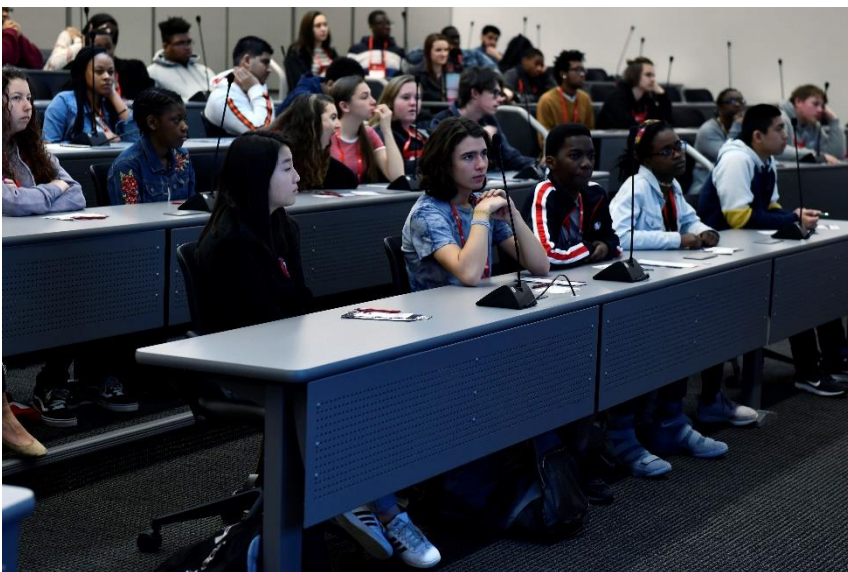
About 50 Next Gen Scholars (9 – 11 grade) from Wicomico High gather in the Lecture Hall for the Engineers Week in the Engineering and Aviation Science Complex.