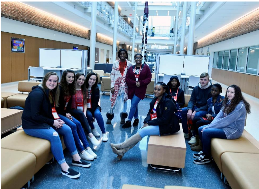
Wi-Hi Next Gen Scholars gather in the Atrium of the Engineering and Aviation Science Complex.