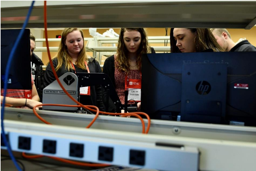
Wi-Hi Next Gen Scholars tested programming and operating of a Microbot Teachmover robotic arm in the Robotics Lab