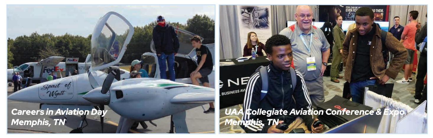
4 | Collegiate Aviation Scholarship Listing

Applicant must be a U.S. citizen. Applicant must be enrolled in and plan to continue a college curriculum leading to a two-year, fouryear, or post-graduate degree in the field of aviation. Proof of enrollment must be provided prior to distribution of award. At the time of application, the applicant must be officially enrolled in a UAA member institution in an aviation-related program. Member must have completed 30 or more credit hours (or the equivalent for Sophomore status) at the UAA institution and must include the institution's UAA number with the application. No exceptions to this criterion. Credits must have been completed and on your transcript at the time of application. Applicant must have a cumulative undergraduate grade point average of 3.0 or above on a 4.0 scale. The completed application must be accompanied by a 250-word typed, double-spaced paper on "How Can I Improve Aviation Education". Please be direct and focused on the topic.