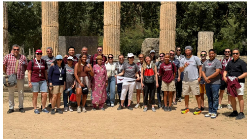
Faculty and students from UMES Kinesiology at the Parthenon, Athens, Greece .

UMES faculty-led study abroad trips are back and better than ever for 2026! Eight exciting trips are ready for Hawks who are ready to explore the world, experience new cultures, and visit popular destinations with UMES faculty. Check page 4 for upcoming trips, dates, and details.