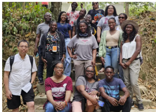
UMES Pharmacy faculty and students visiting Cape Coast Castle, Ghana .