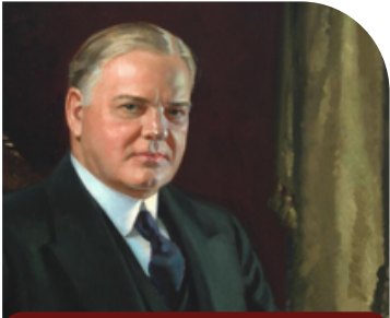
HERBERT HOOVER (1929-1933)

Did you know that there was a U.S. President who spoke Mandarin Chinese?