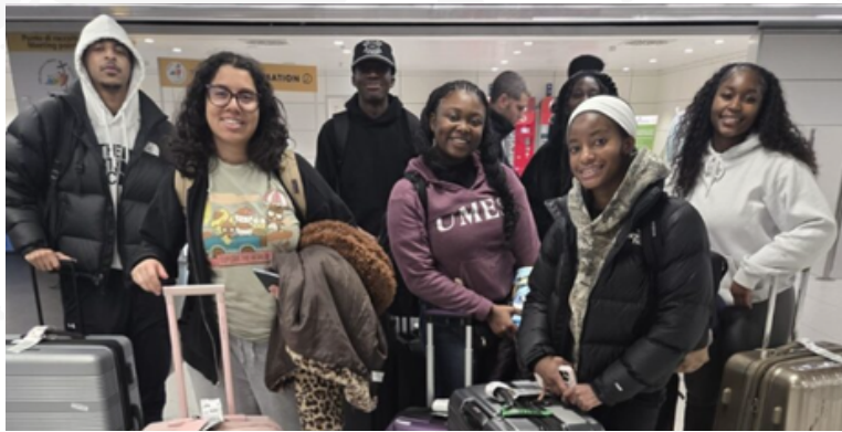
Students pose together upon arriving in Rome, Italy.