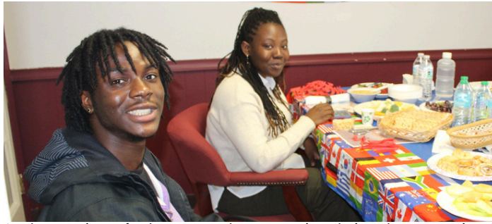
Students enjoy refreshments and conversation during the International Student Networking Events.