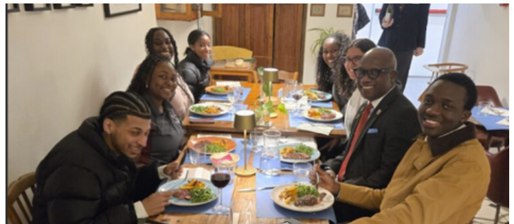
Students visit a local restaurant to experience Italian hospitality firsthand and pose for a photo before enjoying their meal.

How many different countries can UMES students choose from for study abroad?