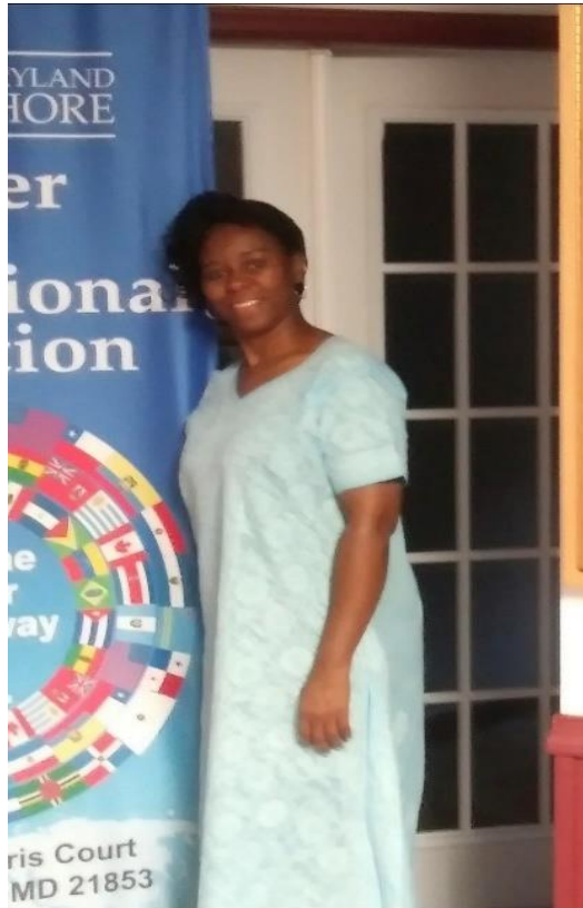
1. GREEN PRINT DRESS