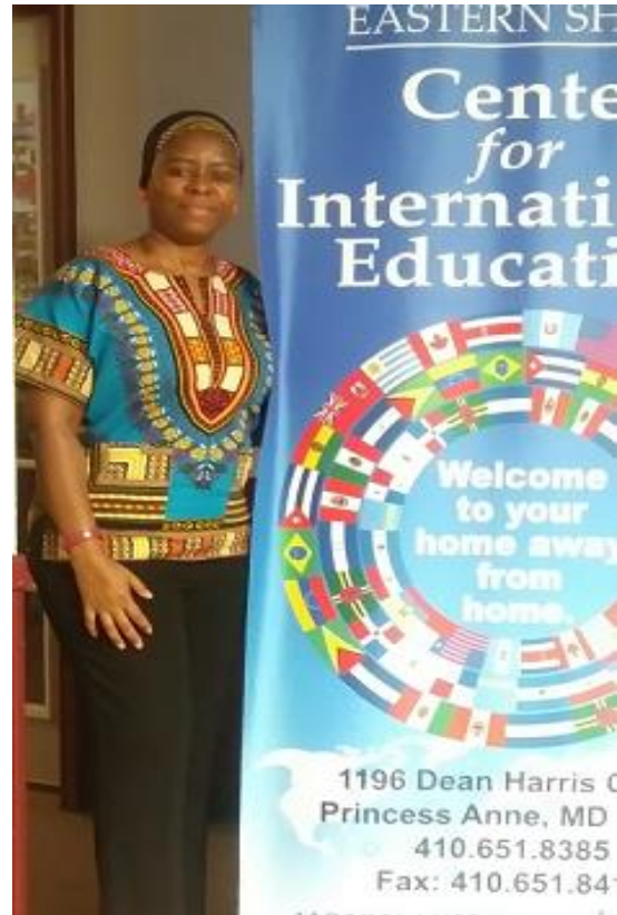
2. DASHIKI TOP