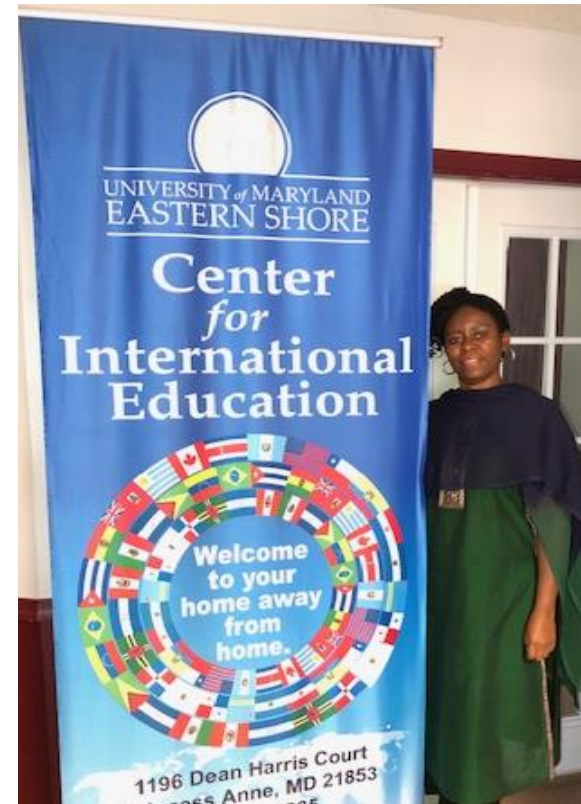
3. NAVY BLUE AND GREEN