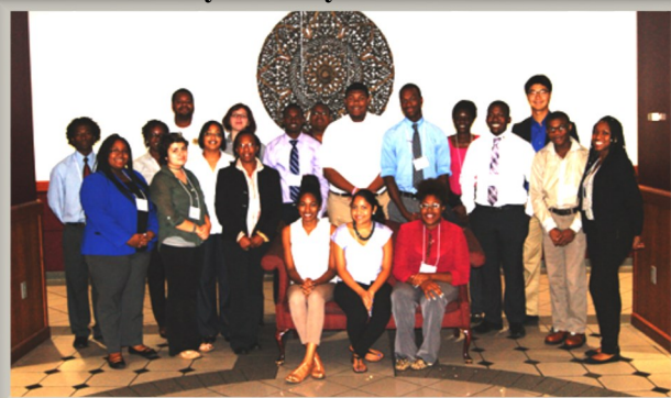
Participants from the University of Maryland Eastern Shore