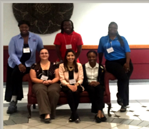
Participants from Delaware State University