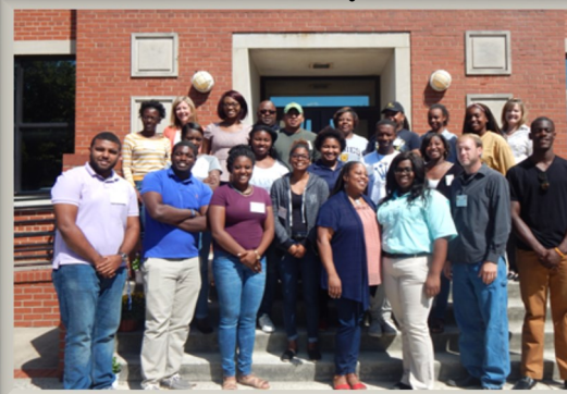
Participants from North Carolina A&T State University