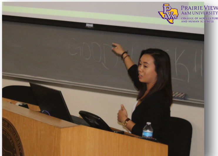
Students and staff participating in mock oral and poster presentation.