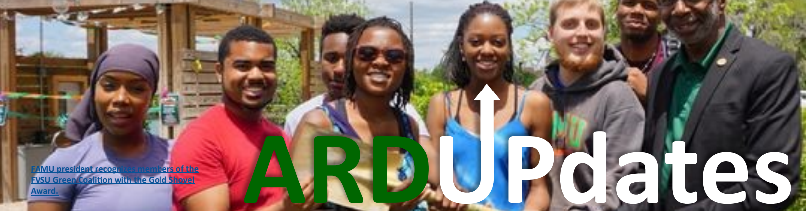
FAMU president recognizes members of the FVSU Green Coalition with the Gold Shovel Award.