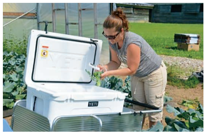
A West Virginia State University farmer using a cooler provided to graduates from their cold-storage training program.

West Virginia has purchased five mobile cold storage units, one Polar King<sup>®</sup> commercial-grade system, three coldstorage stationary and four fabricated units with Coolbot® systems, a controller, and regulator that in conjunction with an air conditioner can create a walk-in cooler, to be used by its six cluster groups. These systems provide the participants with a cooling system to increase the shelf life