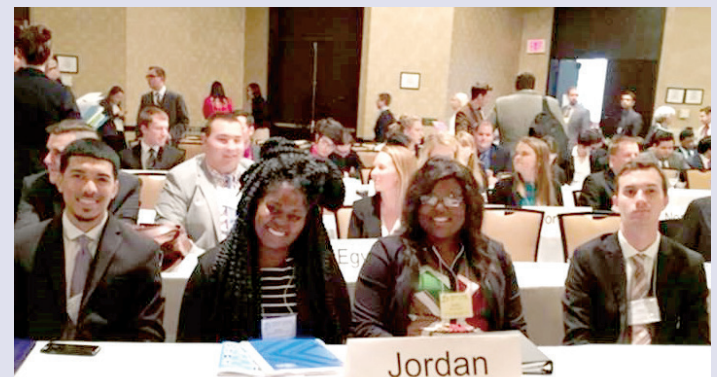
Alcorn State University students, representing the country of Jordan, participating United Nations Conference.

The APHIS funding was provided to recruit the next generation of a more diverse international agriculture workforce, specifically those graduating with technical degrees in one or more of